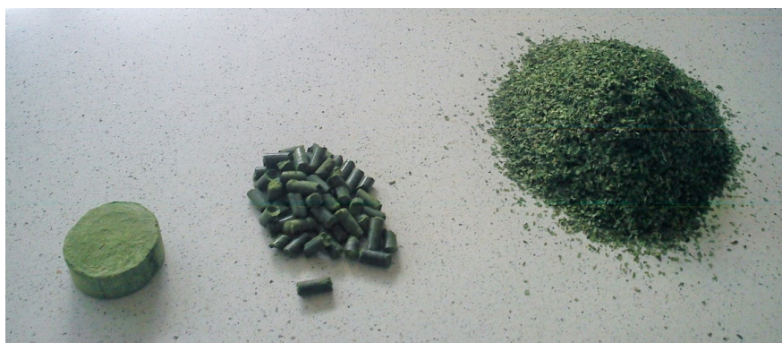
Fig. 2. Overview of raw material and granulated samples of parsley weighing 51 g

The tests of compacting the dried material at the parameters for biomass intended for energy purposes enabled to achieve both pellets and briquettes of very good quality. An exemplary comparison of loose raw material with pellets and briquettes of the same weight is shown in Figures 2 and 3.