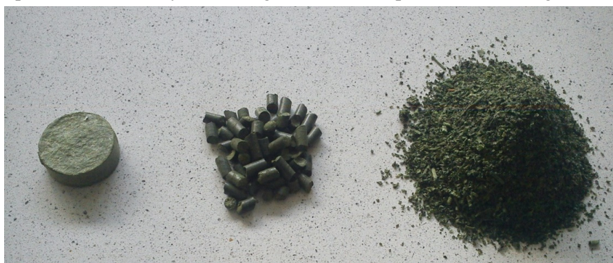
Fig. 3. Overview of raw material and granulated samples of chives weighing 43 g

specific gravity of parsley remained at a similar level of about 1090 \text{ kg}\cdot\text{m}^{-3} , whereas in the case of chives, the briquettes had a density of 1246 \text{ kg}\cdot\text{m}^{-3} , while the pellets had 1012 \text{ kg}\cdot\text{m}^{-3} .